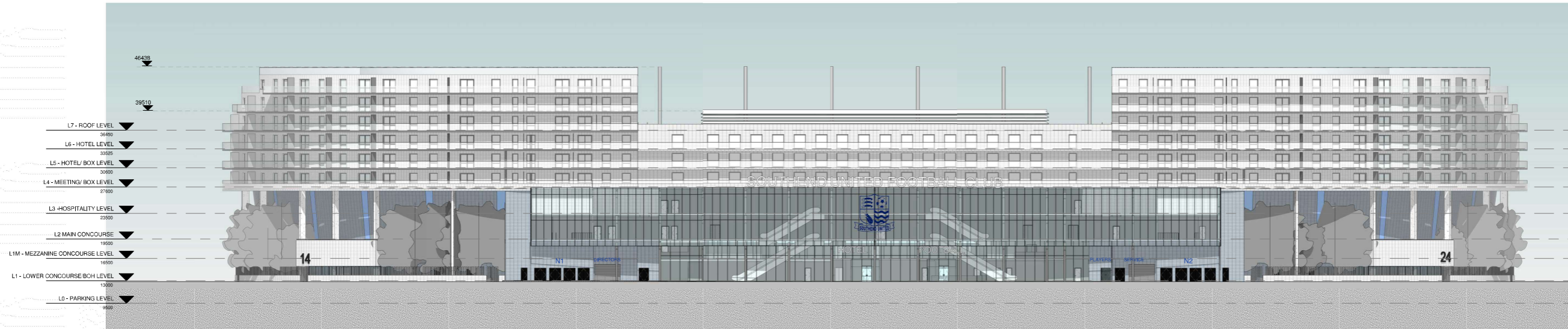
1. NORTH ELEVATION - PHASE 02 1 : 250